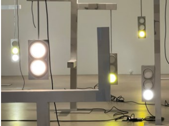
Installationsansicht LUMA Arles, 2025