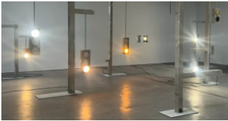
Installation view LUMA Arles, 2025